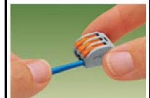
Then push down lever to its closed position.

Questions? Call us at: 1 (800) 382-1388 M-TH 8:30AM-5:30PM / FR 9:30AM-5:30PM EST