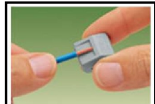
Strip wire 9-10 mm. Use wire gauge on bottom to verify.